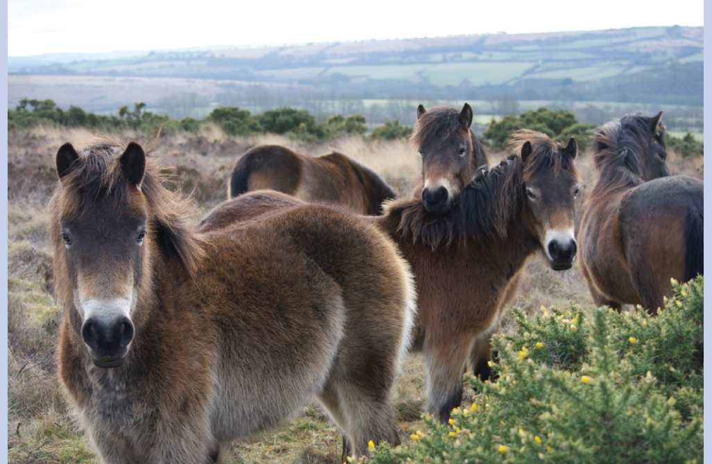
Top right: Some of the herd on Winsford Hill