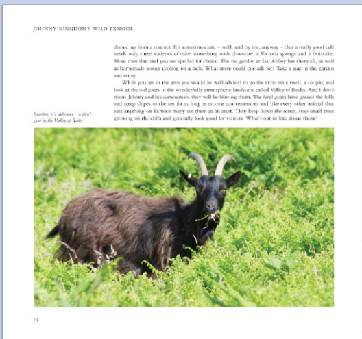
Below: Example of a double-page spread.